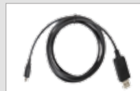
Programming cable USB PC69