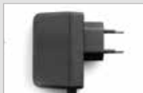
EU power supply unit for Micro-USB PS1029