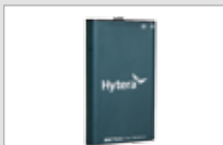
Lithium-ion battery (2000 mAh) BL2009