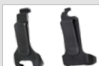
Belt clip BC20 (PD355), BC21 (PD365)