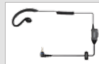
Earphone with C-clip EH516