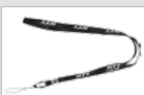
Hand strap (Nylon) RO01